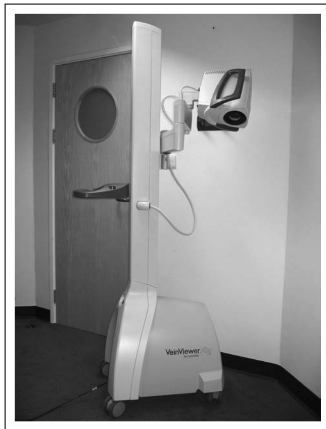
Fig. 1. Mobile vein imaging system.

Fifty questionnaires were completed between June 1, 2009, and March 31, 2010: 11 by consultants, 16 by registrars, 20 by senior house officers, and 3 by nurses. They had been taught how to use the Vein Viewer by a colleague (n = 37) or by reading the instruction manual (n = 13). A calibration was carried out once every morning, which lasted <5 min. After that, it took about 1 min to switch on the device. No additional patient preparation was necessary. Of the 50 patients, 38 had blood drawn for diagnostic purposes, and 12 had a cannula inserted for intravenous treatment. The mean age of the